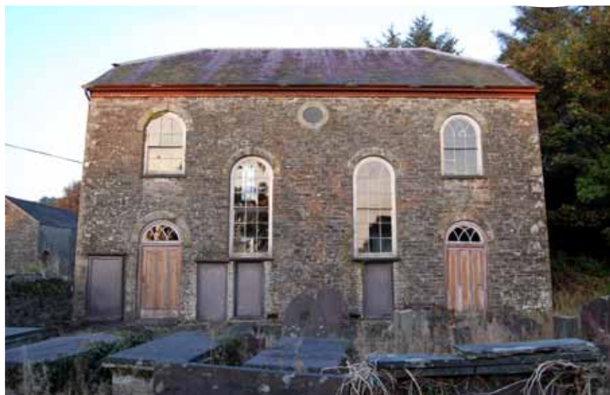
Yr Hen Gapel, Llwynrhydowen

Thank you for your support - it is appreciated! We welcome local friends and supporters at all our various projects.