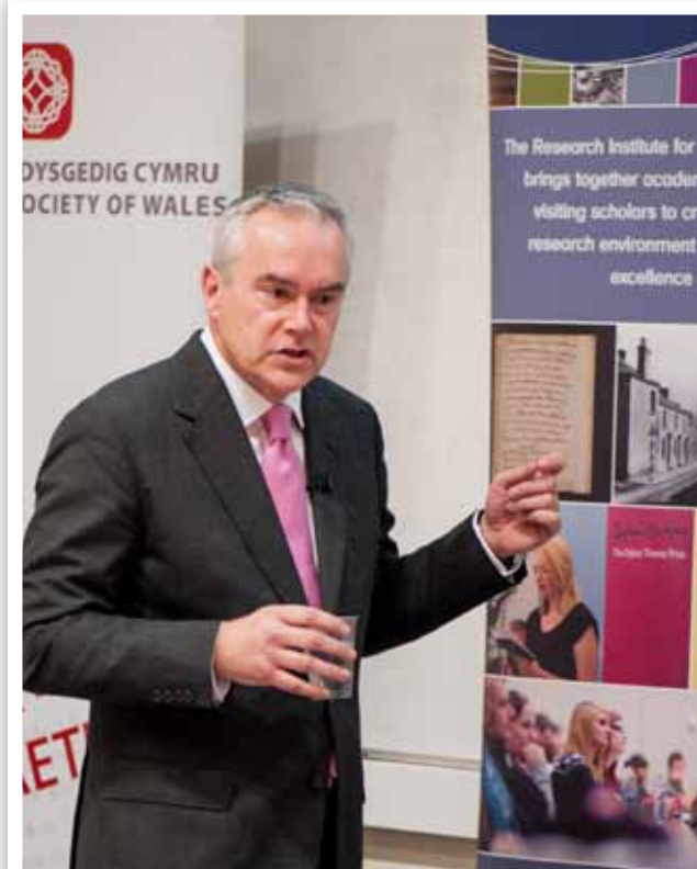
Huw Edwards addressing the Learned Society of Wales on Championing the Chapels.