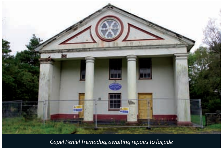
Capel Peniel Tremadog, awaiting repairs to façade