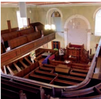
Capel Peniel Tremadog Interior

Our various projects also need local friends and supporters. We welcome active local volunteers to become involved, to help keep an eye on buildings, to help arrange occasional events and to open buildings to the public as buildings are repaired.