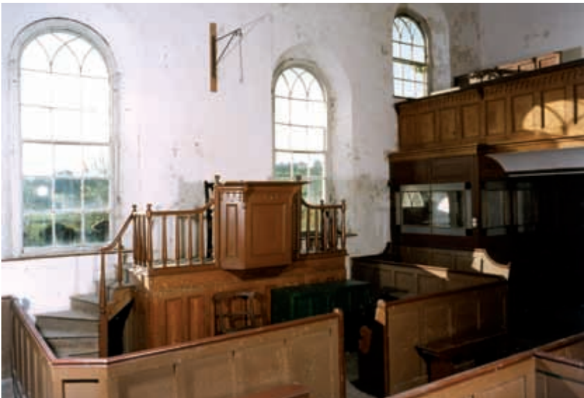
Interior of Yr Hen Gapel, Llwynrhydowen

clergy from their livings. Gwilym Marles was an advocate of the new rationalistic theology of Theodore Parker, so that in 1860, as in 1733, Llwynrhydowen continued to blaze new trails.