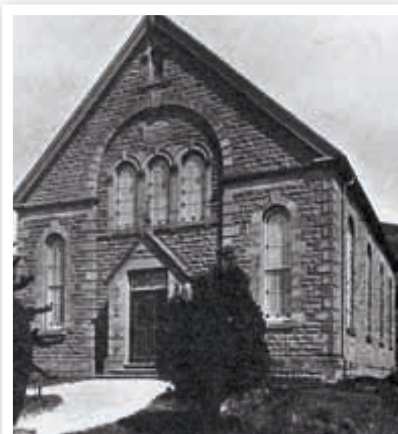
Capel Newydd Llwynrhydowen 1879